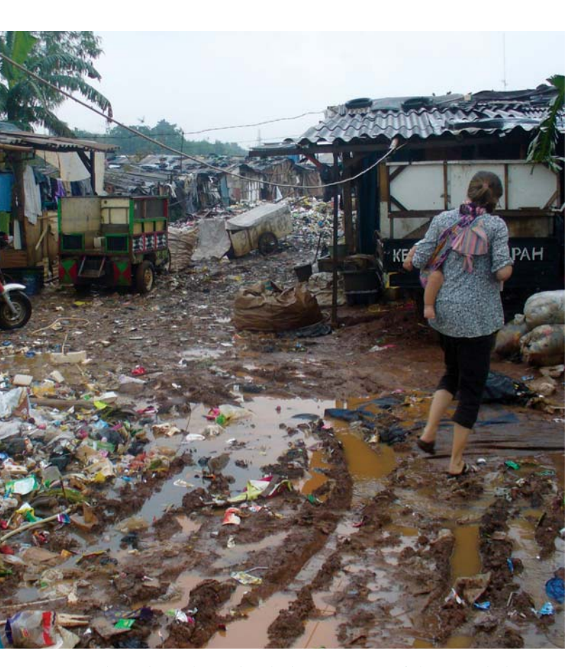
Trash and mud are the daily existence of the people living in the Asian slum community where Grace (pictured) lives. How is the good news proclaimed here?

What does it mean to proclaim the gospel, the good news? How do we do so holistically as Paul speaks of — with words, deeds, and power?